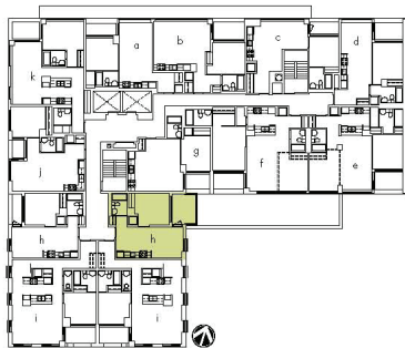
floors 2 to 3