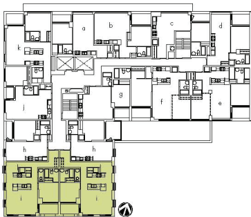
floors 2 to 3