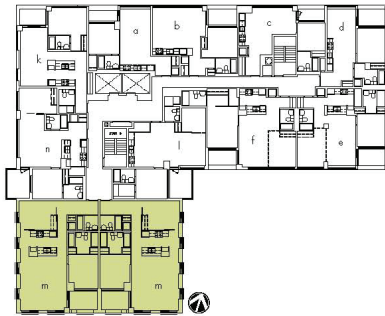
floors 4 to 8