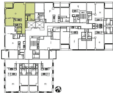
floors 6 to 10